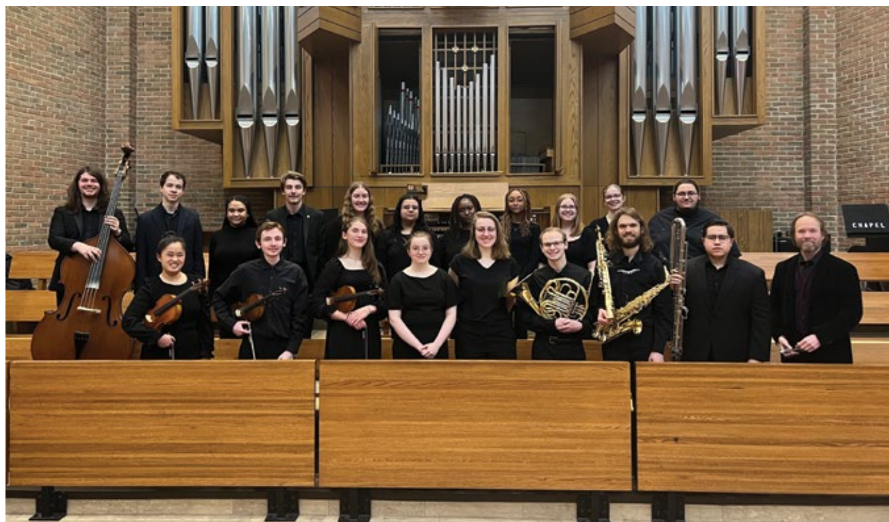
Chamber Orchestra & Schola Cantorum

*indicates student at Walther Christian Academy, Melrose Park, IL