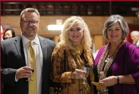
Photos from 2019 in-person event.